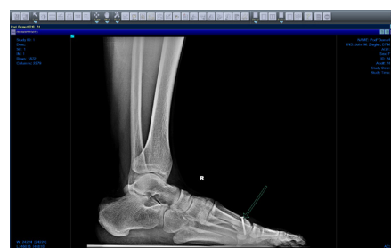
PACSmart images are 100% native DICOM 3.0 format.